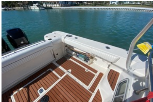
2002 Boston Whaler 295 Conquest - Cockpit