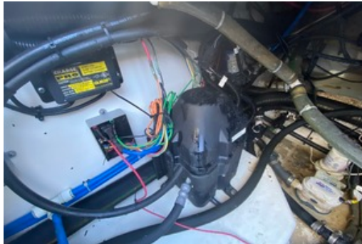
2002 Boston Whaler 295 Conquest - Electrical