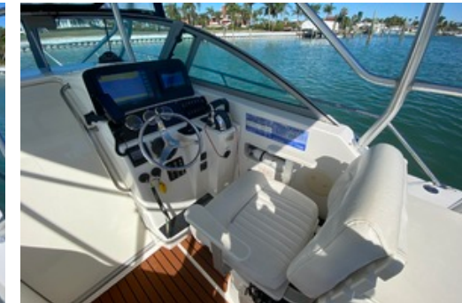
2002 Boston Whaler 295 Conquest - Helm