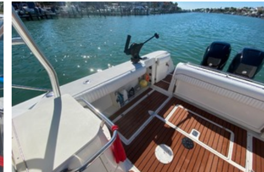
2002 Boston Whaler 295 Conquest - Cockpit