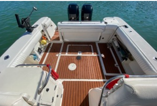
2002 Boston Whaler 295 Conquest - Cockpit