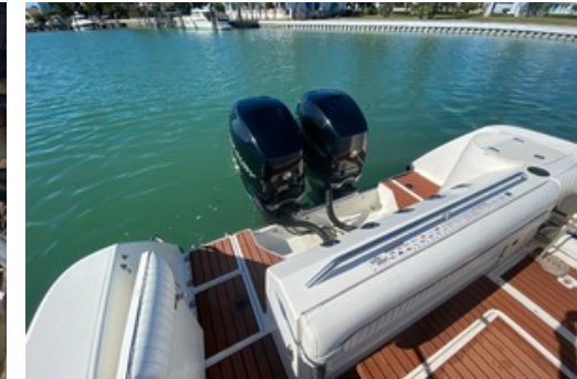
2002 Boston Whaler 295 Conquest - Cockpit Doorway