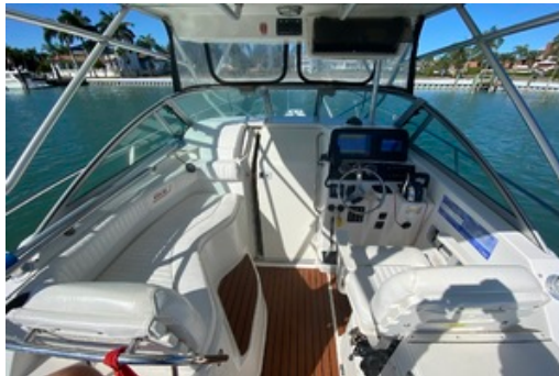
2002 Boston Whaler 295 Conquest - Bay Dreaming Helm