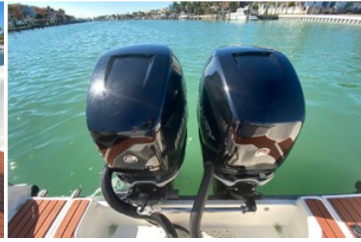
2002 Boston Whaler 295 Conquest - Outboard Engines