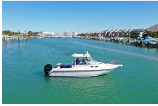
2002 Boston Whaler 295 Conquest - Bay Dreaming - Profile