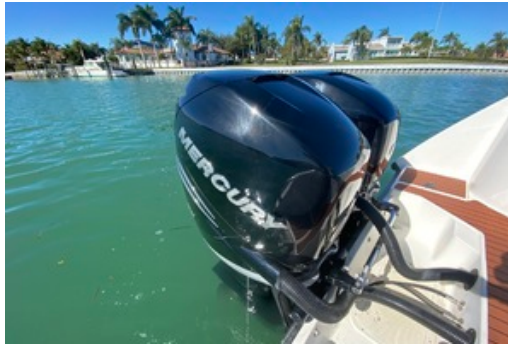
2002 Boston Whaler 295 Conquest - Outboard Engines