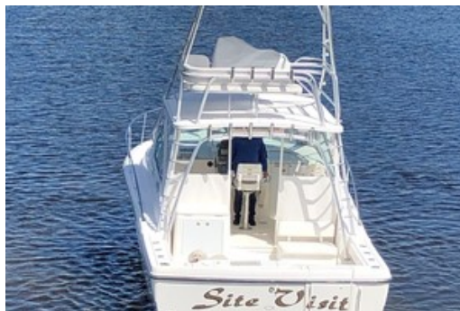
2007 33 Rampage Transom