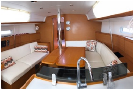
2014 38 Jeanneau Sun Odyssey 379 - Moriarty - Salon