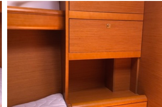
2014 38 Jeanneau Sun Odyssey 379 - Moriarty - Master Cabin Storage