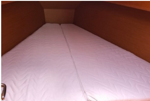
2014 38 Jeanneau Sun Odyssey 379 - Moriarty - Master Cabin