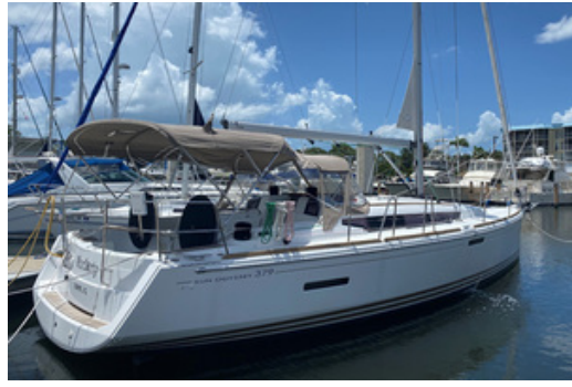
2014 38 Jeanneau Sun Odyssey 379 - Moriarty - Main Profile