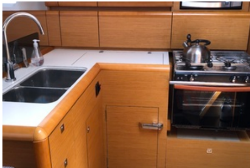
2014 38 Jeanneau Sun Odyssey 379 - Moriarty - Galley