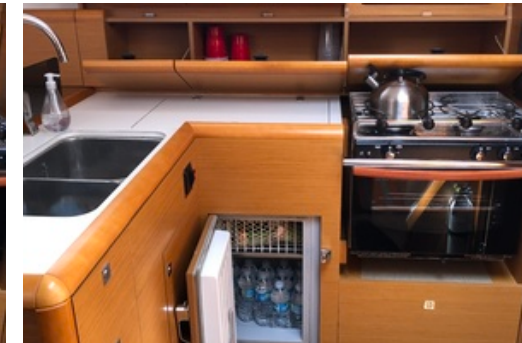
2014 38 Jeanneau Sun Odyssey 379 - Moriarty - Galley