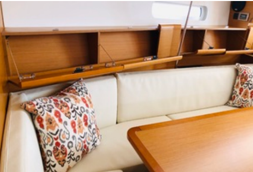
2014 38 Jeanneau Sun Odyssey 379 - Moriarty - Salon