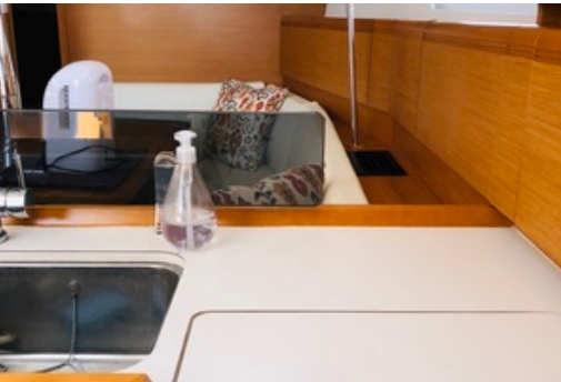
2014 38 Jeanneau Sun Odyssey 379 - Moriarty - Galley