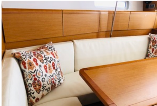
2014 38 Jeanneau Sun Odyssey 379 - Moriarty - Salon