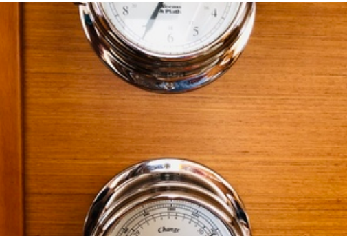
2014 38 Jeanneau Sun Odyssey 379 - Moriarty - Clock