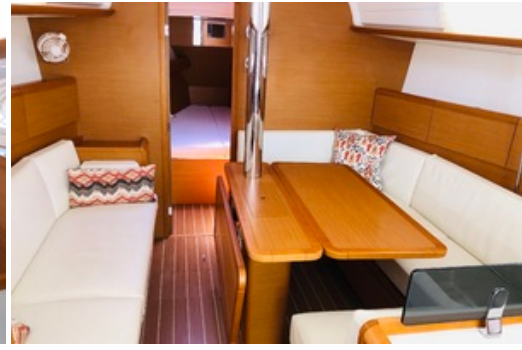
2014 38 Jeanneau Sun Odyssey 379 - Moriarty - Salon