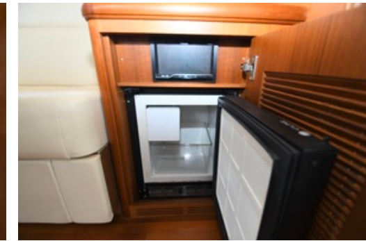
2014 Grand Banks 43 Europa