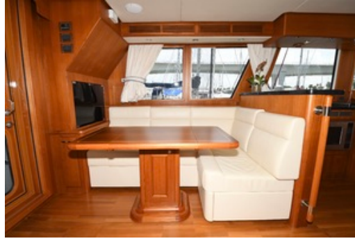
2014 Grand Banks 43 Europa