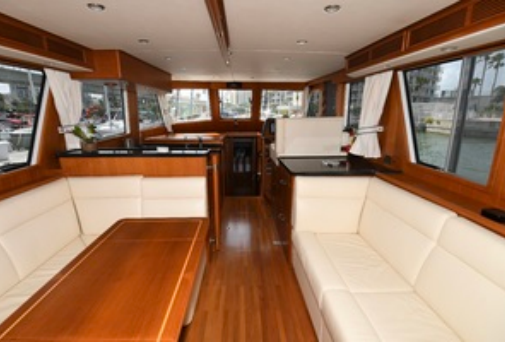
2014 Grand Banks 43 Europa