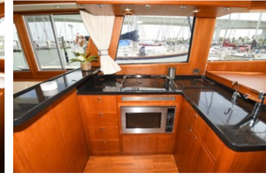
2014 Grand Banks 43 Europa