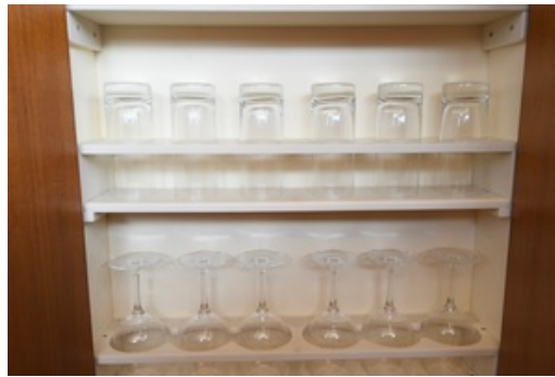
2014 Grand Banks 43 Europa