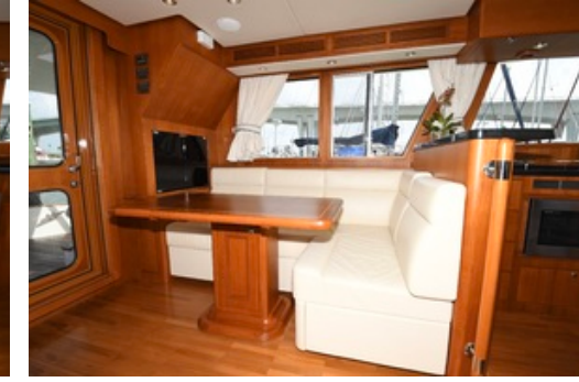
2014 Grand Banks 43 Europa