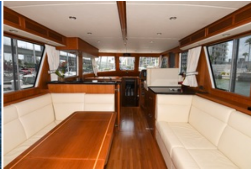
2014 Grand Banks 43 Europa