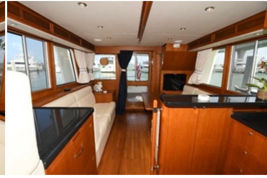
2014 Grand Banks 43 Europa