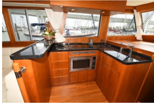
2014 Grand Banks 43 Europa