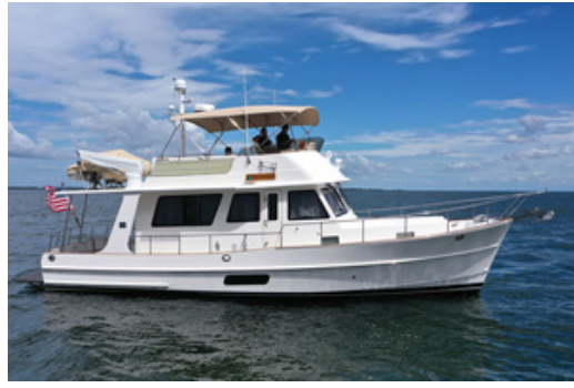
2014 Grand Banks 43 Europa Profile