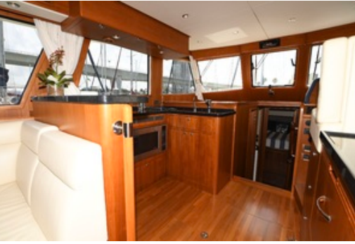
2014 Grand Banks 43 Europa