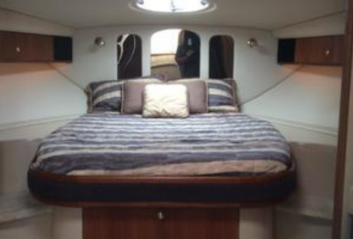
2000 38 Cruisers CDreams Forward Stateroom