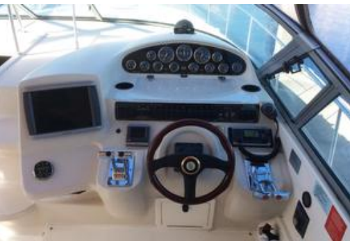
2000 38 Cruisers CDreams Helm