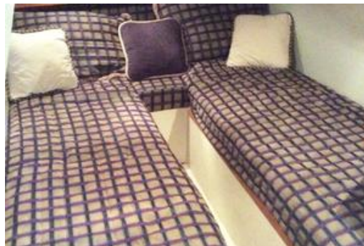
2000 38 Cruisers CDreams Guest Stateroom