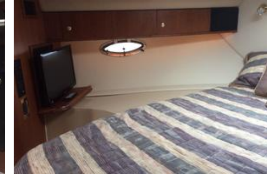
2000 38 Cruisers CDreams Forward SR