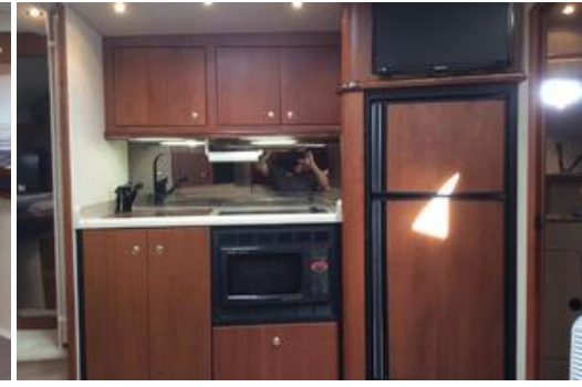
2000 38 Cruisers CDreams Galley