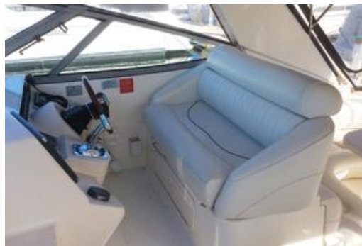
2000 38 Cruisers CDreams Helm