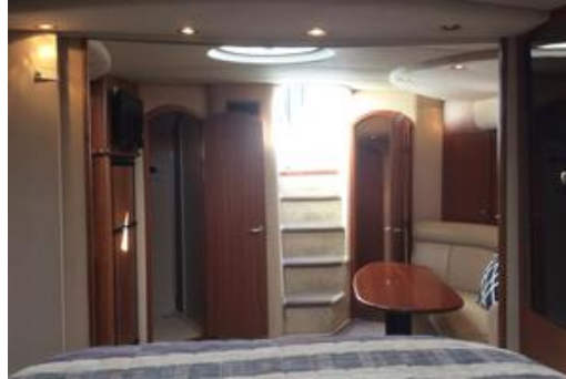
2000 38 Cruisers CDreams Forward SR