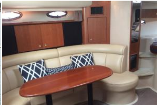
2000 38 Cruisers CDreams Dinette