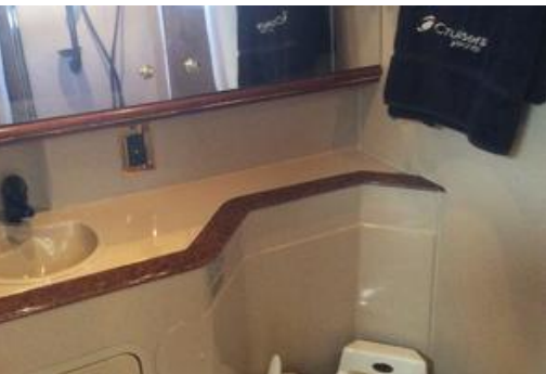
2000 38 Cruisers CDreams Head