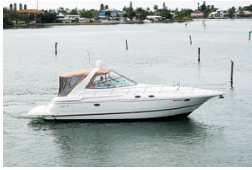
2000 38 Cruisers CDreams