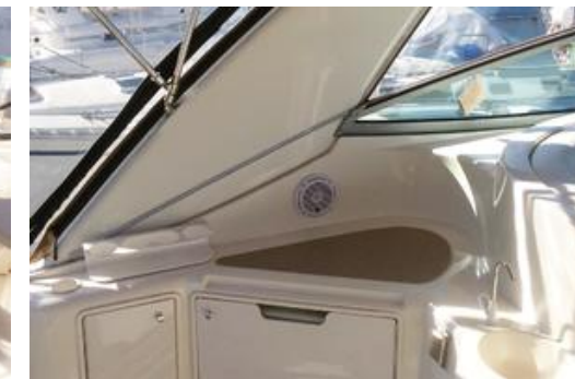
2000 38 Cruisers CDreams Cockpit