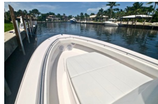
2019 39 FA Contender Bow (1)