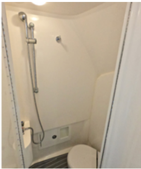
2019 39 FA Contender Head 2