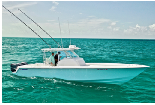
2019 39 FA Contender IYBA Profile