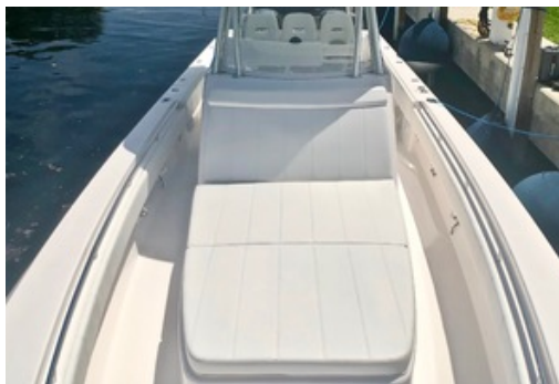
2019 39 FA Contender Lounge Seating And Storage (1)