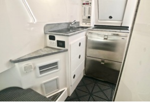
2019 39 FA Contender Galley (3)