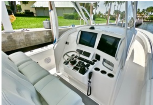
2019 39 FA Contender Helm (1)