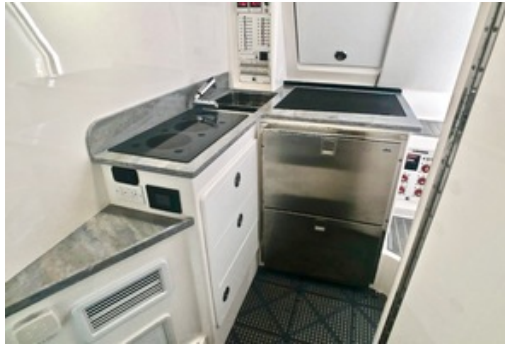
2019 39 FA Contender Galley (1)