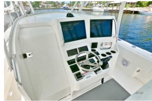
2019 39 FA Contender Helm (2)