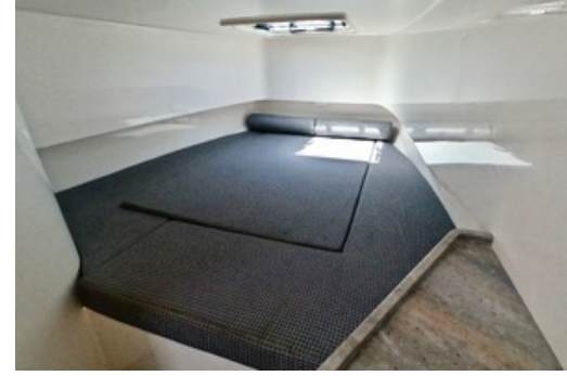
2019 39 FA Contender Berth (1)