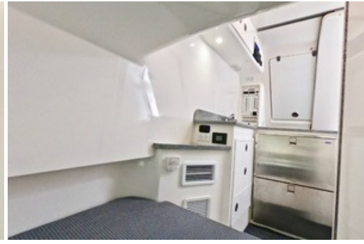
2019 39 FA Contender Galley (2)