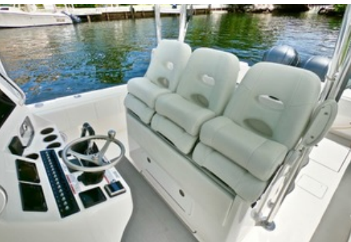
2019 39 FA Contender Helm (3)