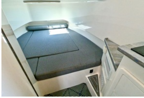
2019 39 FA Contender Berth (2)