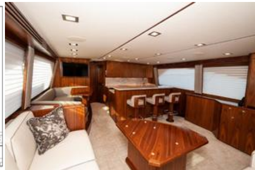
2019 Viking 68 Cnv Salon