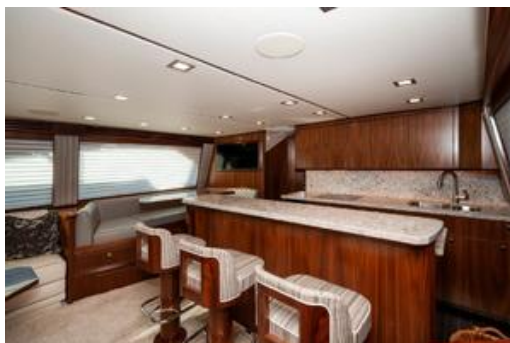
2019 Viking 68 Cnv Galley