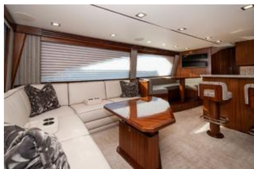
2019 Viking 68 Cnv Salon