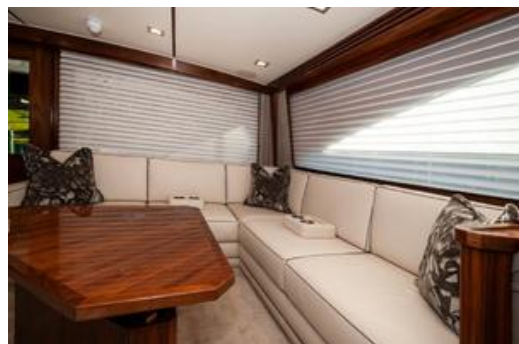
2019 Viking 68 Cnv Salon