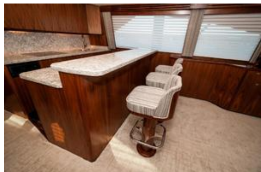
2019 Viking 68 Cnv Galley