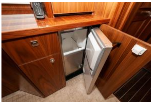
2019 Viking 68 Cnv Salon