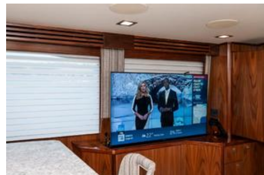
2019 Viking 68 Cnv Salon