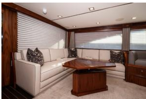
2019 Viking 68 Cnv Salon