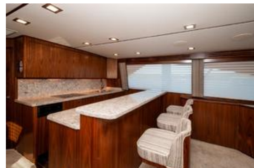
2019 Viking 68 Cnv Galley