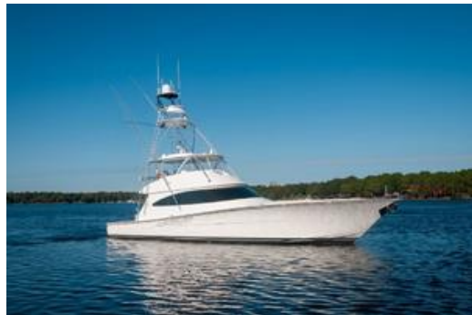
2019 Viking 68 Cnv Starboard Profile