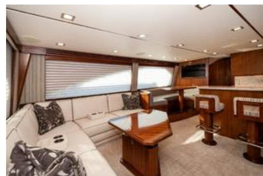
2019 Viking 68 Cnv Salon