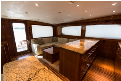
2008 Hatteras 60 Convertible Galley