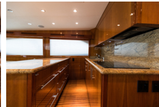
2008 Hatteras 60 Convertible Galley