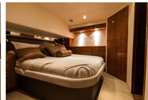
2008 Hatteras 60 Convertible Master Stateroom