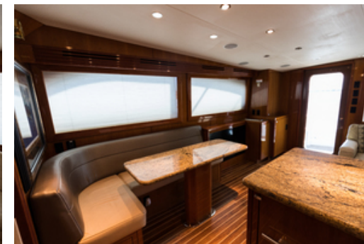
2008 Hatteras 60 Convertible Dinette