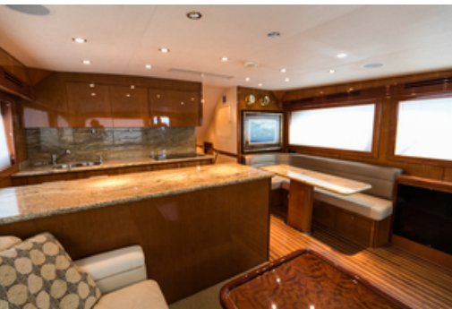
2008 Hatteras 60 Convertible Salon