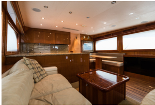
2008 Hatteras 60 Convertible Salon