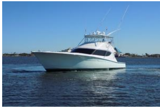
2008 Hatteras 60 Convertible Profile