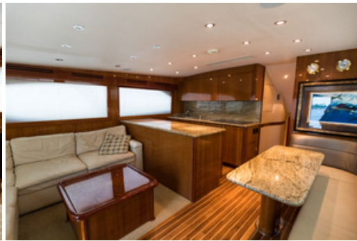
2008 Hatteras 60 Convertible Salon