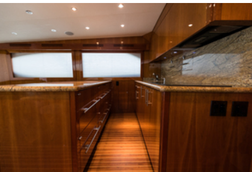
2008 Hatteras 60 Convertible Galley