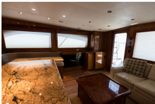
2008 Hatteras 60 Convertible Galley