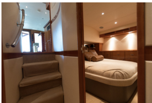
60 Convertible Companionway