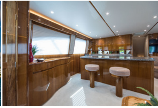
Viking 66 Convertible Salon