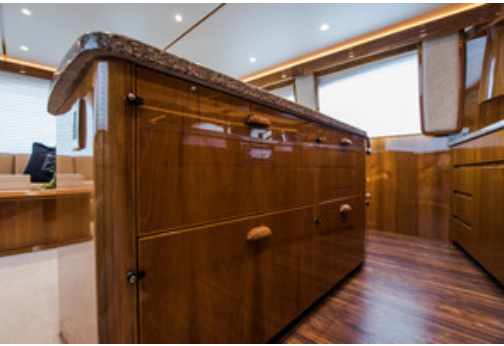
Viking 66 Convertible Galley Sub-Zero Units