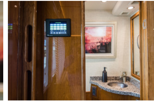
Viking 66 Convertible Day Head