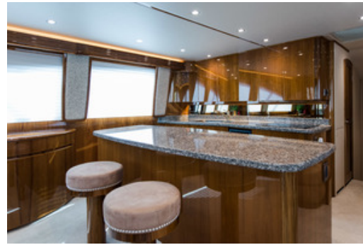
Viking 66 Convertible Galley