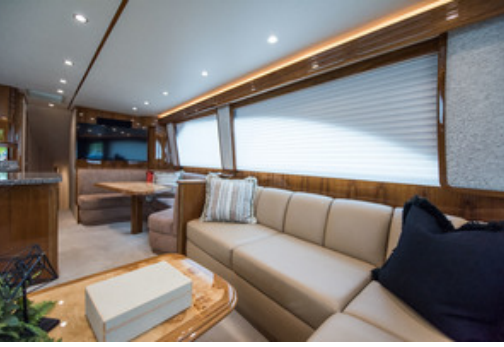
Viking 66 Convertible Salon