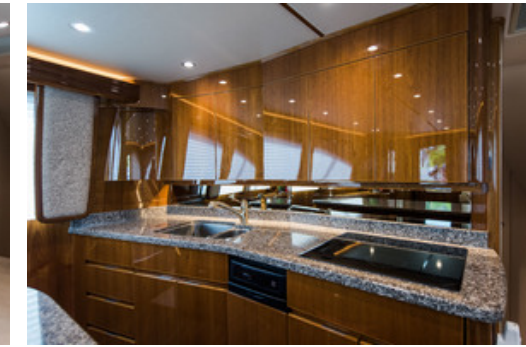
Viking 66 Convertible Galley