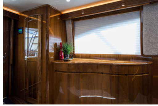
Viking 66 Convertible Salon Storage and Pop-Up TV