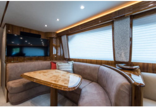
Viking 66 Convertible Dinette