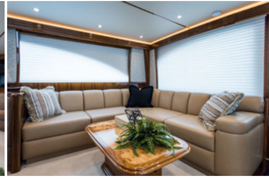
Viking 66 Convertible Salon