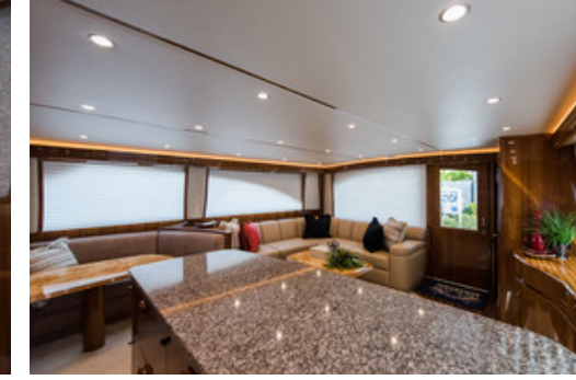
Viking 66 Convertible Galley and Salon