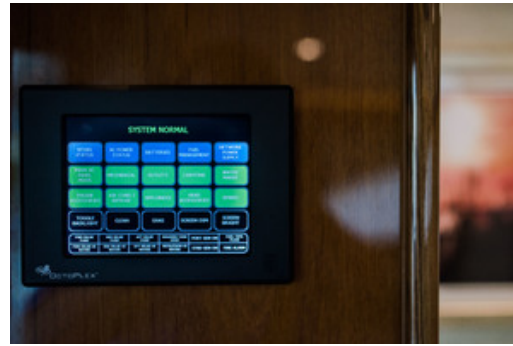
Viking 66 Convertible Octoplex System