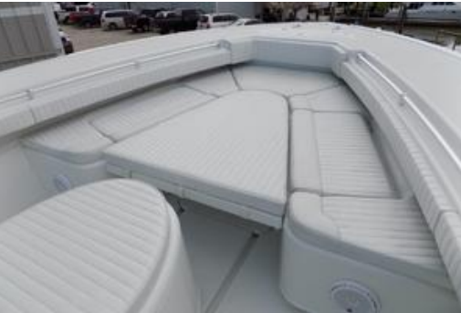
Why Knot Yellowfin 2014 39 Center Console