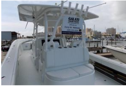
Why Knot Yellowfin 2014 39 Center Console