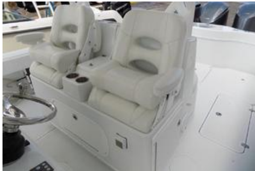
Why Knot Yellowfin 2014 39 Center Console