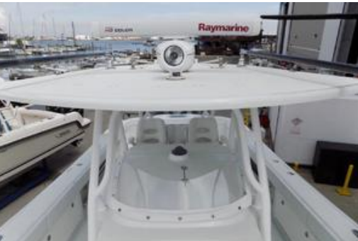
Why Knot Yellowfin 2014 39 Center Console