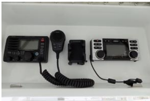
Why Knot Yellowfin 2014 39 Center Console