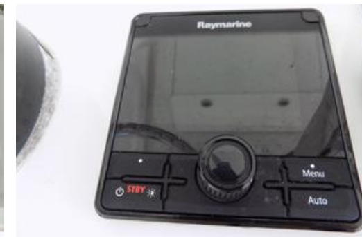
Why Knot Yellowfin 2014 39 Center Console