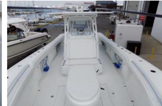
Why Knot Yellowfin 2014 39 Center Console