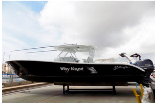
Why Knot Yellowfin 2014 39 Center Console