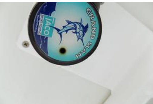
Why Knot Yellowfin 2014 39 Center Console