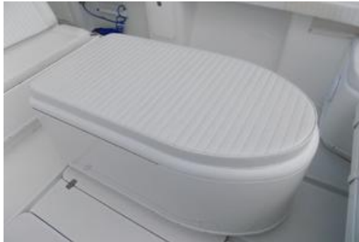
Why Knot Yellowfin 2014 39 Center Console