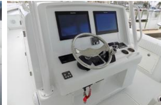
Why Knot Yellowfin 2014 39 Center Console