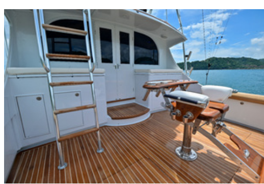
2008 Maximus American Marine Boatworks 48 Convertible Whiskey Blues