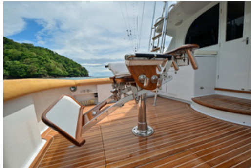
2008 Maximus American Marine Boatworks 48 Convertible Whiskey Blues - Fighting Chair