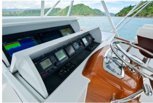
2008 Maximus American Marine Boatworks 48 Convertible Whiskey Blues - Helm and Electronics