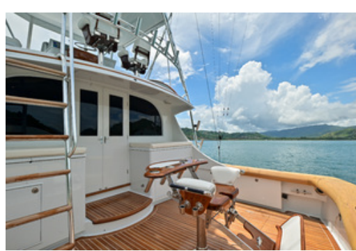
2008 Maximus American Marine Boatworks 48 Convertible Whiskey Blues