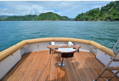
2008 Maximus American Marine Boatworks 48 Convertible Whiskey Blues - Cockpit and Fighting Chair