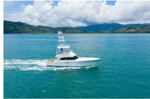
2008 Maximus American Marine Boatworks 48 Convertible Whiskey Blues - Starboard Profile