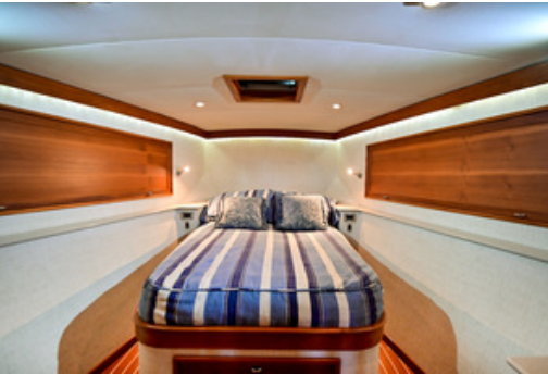
2008 Maximus American Marine Boatworks 48 Convertible Whiskey Blues - Forward Stateroom