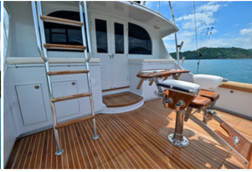
2008 Maximus American Marine Boatworks 48 Convertible Whiskey Blues - Cockpit