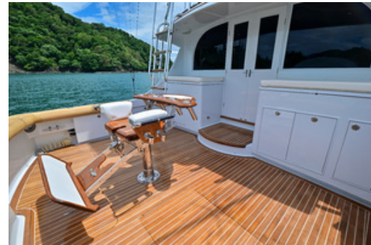
2008 Maximus American Marine Boatworks 48 Convertible Whiskey Blues