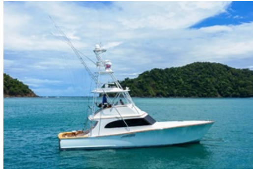
2008 Maximus American Marine Boatworks 48 Convertible Whiskey Blues - Profile Picture