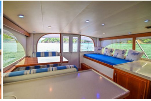
2008 Maximus American Marine Boatworks 48 Convertible Whiskey Blues - Salon