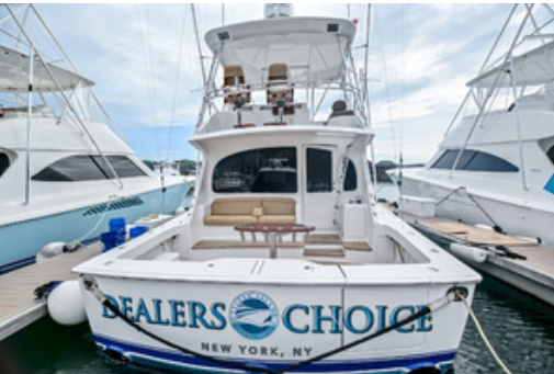
2015 Viking 46 Convertible "Dealers Choice" Aft Profile