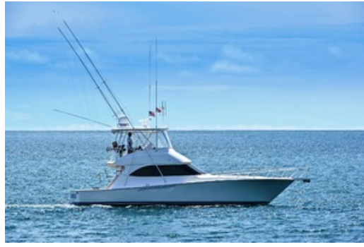
2015 Viking 46 Convertible "Dealers Choice" Profile Picture