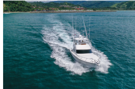
2015 Viking 46 Convertible "Dealers Choice" Forward Running Profile