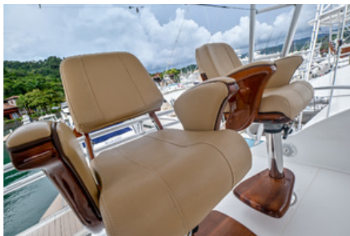
2015 Viking 46 Convertible "Dealers Choice" Helm Chairs