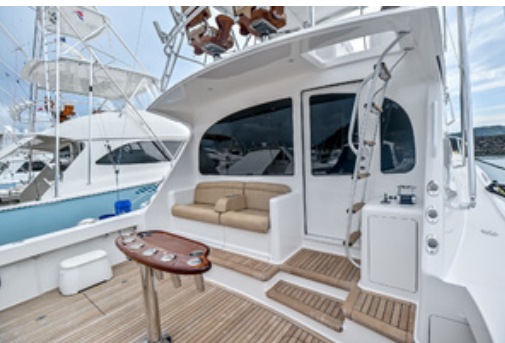
2015 Viking 46 Convertible "Dealers Choice" Cockpit and Mezzanine