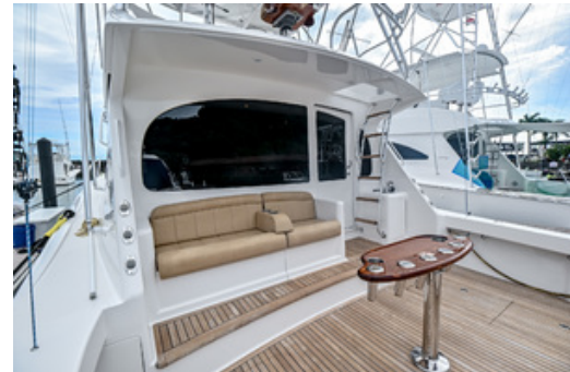
2015 Viking 46 Convertible "Dealers Choice" Cockpit and Mezzanine