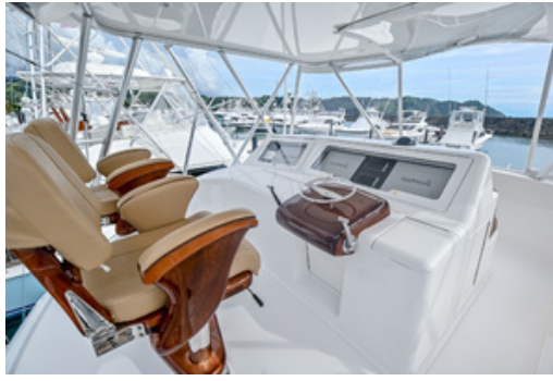
2015 Viking 46 Convertible "Dealers Choice" Helm and Electronics