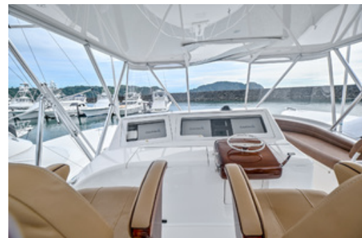
2015 Viking 46 Convertible "Dealers Choice" Helm Chairs and Electronics