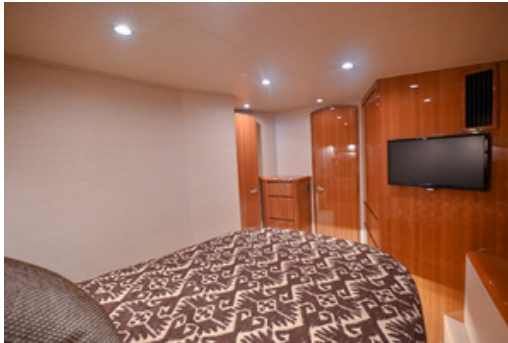
2015 Viking 46 Convertible "Dealers Choice" Master Stateroom