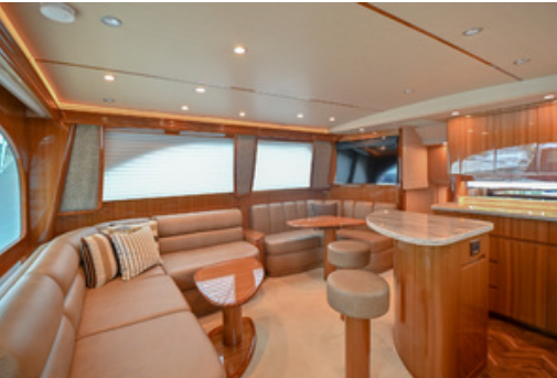
2015 Viking 46 Convertible "Dealers Choice" Salon