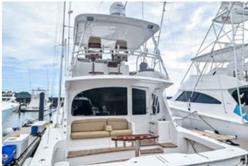
2015 Viking 46 Convertible "Dealers Choice" Cockpit and Flybridge