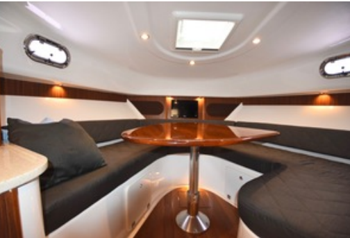
2015 Pursuit 345 Offshore - Dinette / Berth