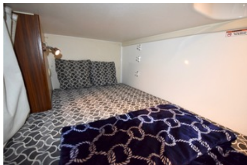
2015 Pursuit 345 Offshore - Berth