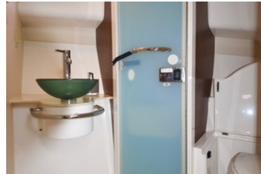
2015 Pursuit 345 Offshore - Head