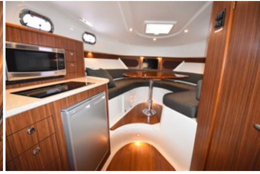
2015 Pursuit 345 Offshore - Galley / Dinette