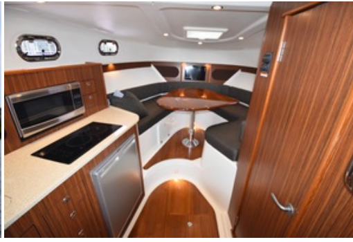
2015 Pursuit 345 Offshore - Galley / Dinette