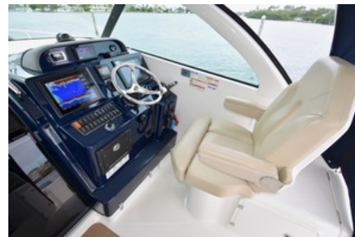
2015 Pursuit 345 Offshore - Helm