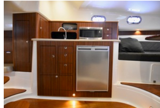
2015 Pursuit 345 Offshore - Galley