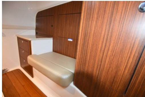
2015 Pursuit 345 Offshore - Port