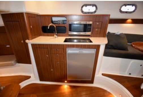
2015 Pursuit 345 Offshore - Galley