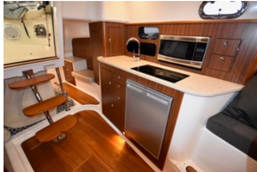
2015 Pursuit 345 Offshore - Galley