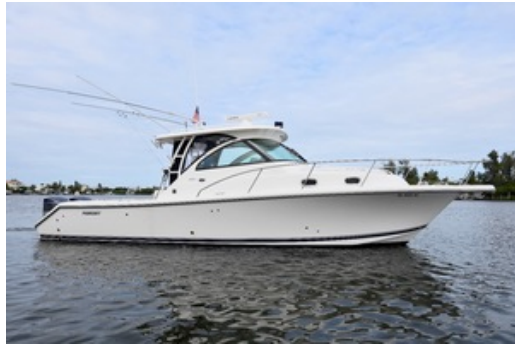
2015 Pursuit 345 Offshore