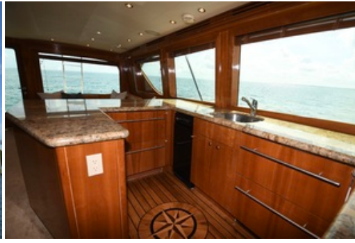
65 Hatteras Convertible Galley