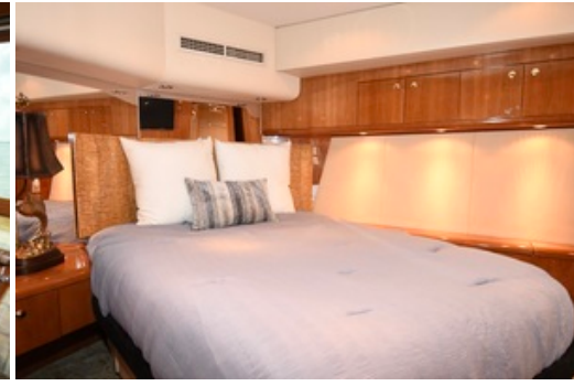
65 Hatteras Convertible Stateroom