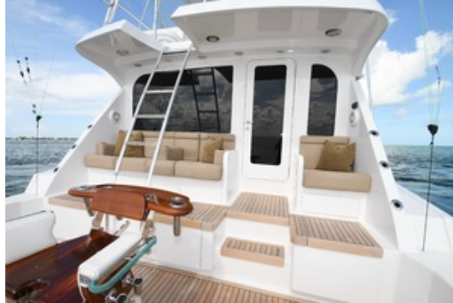
65 Hatteras Convertible Cockpit