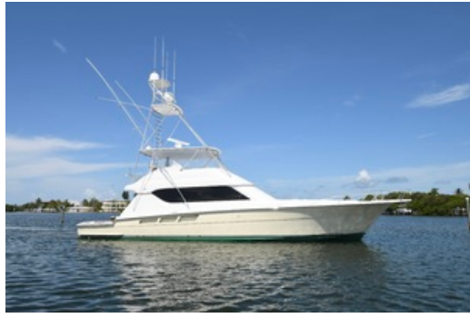
2003 Hatteras 65 Convertible