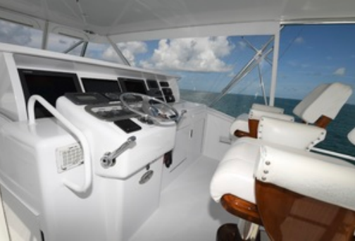
65 Hatteras Convertible Helm