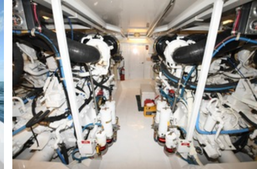
65 Hatteras Convertible Engine Room