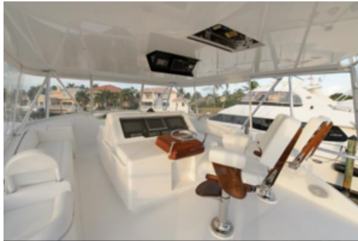
2009 Viking 68 Convertible - Galati Yacht Sales Trade - Flybridge