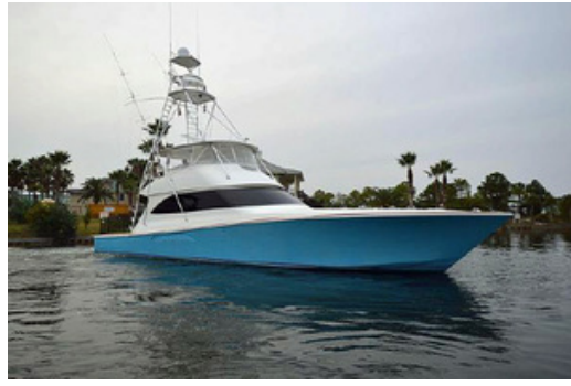
2009 Viking 68 Convertible - Galati Yacht Sales Trade