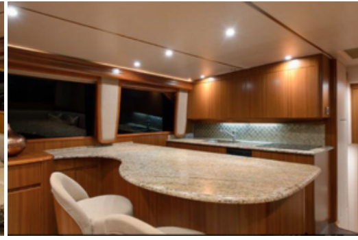
2009 Viking 68 Convertible - Galati Yacht Sales Trade - Galley