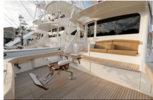
2009 Viking 68 Convertible - Galati Yacht Sales Trade - Cockpit