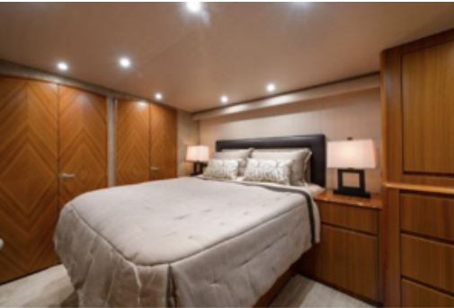
2009 Viking 68 Convertible - Galati Yacht Sales Trade - Master Stateroom