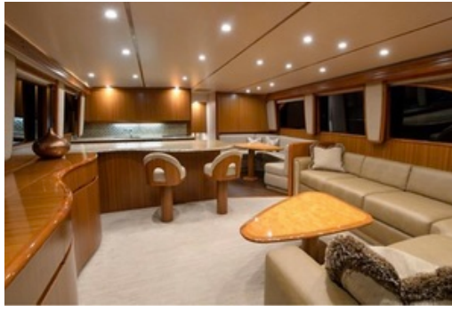
2009 Viking 68 Convertible - Galati Yacht Sales Trade - Salon