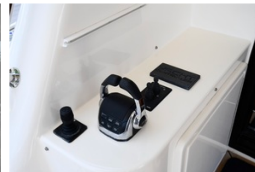
Cockpit Aft Docking Controls