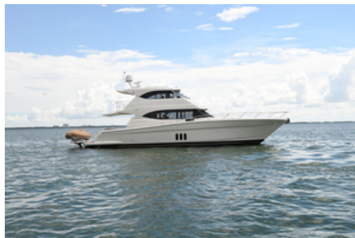
2015 Maritimo M58 Yacht - Profile