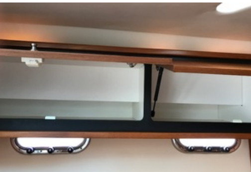
2011 Tiara 3500 Sovran - Salon Upper Storage