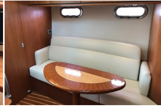
2011 Tiara 3500 Sovran - Salon