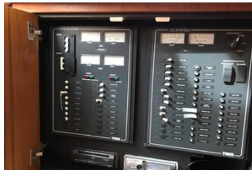
2011 Tiara 3500 Sovran - Main Distribution Panel