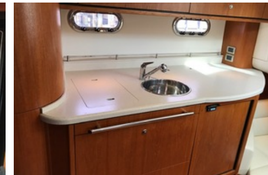
2011 Tiara 3500 Sovran - Galley