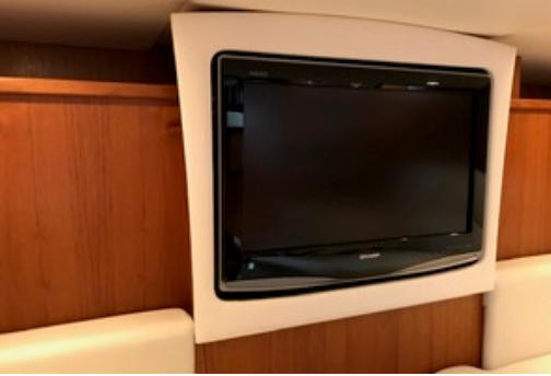
2011 Tiara 3500 Sovran - Salon TV