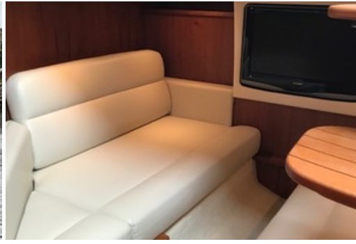
2011 Tiara 3500 Sovran - Salon