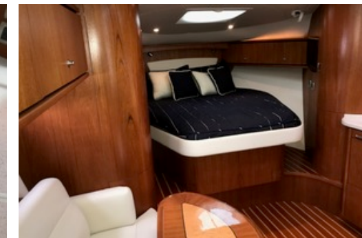
2011 Tiara 3500 Sovran - Master Stateroom