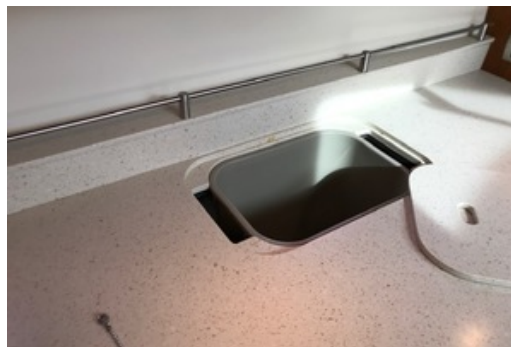
2011 Tiara 3500 Sovran - Galley