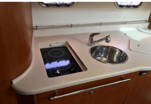
2011 Tiara 3500 Sovran - Galley