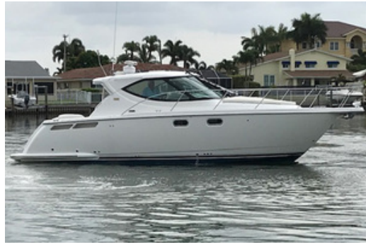
2011 Tiara 3500 Sovran - Profile