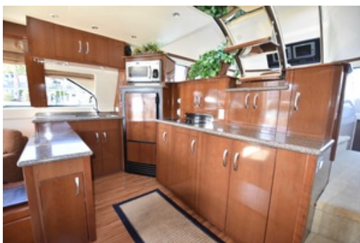
Carver 52 Voyager 2008 - Galley