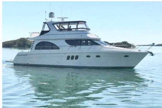
Carver 52 Voyager 2008