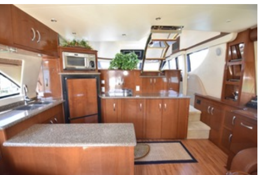
Carver 52 Voyager 2008 - Galley