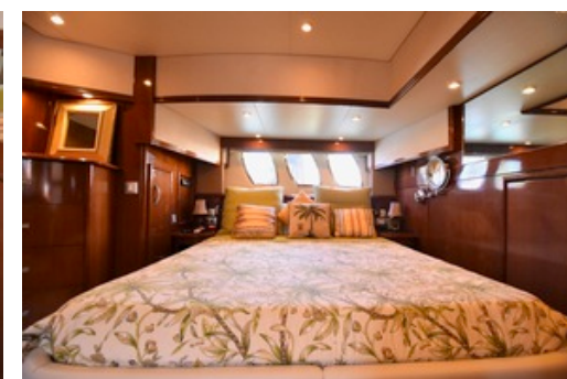
Carver 52 Voyager 2008 - Master Stateroom