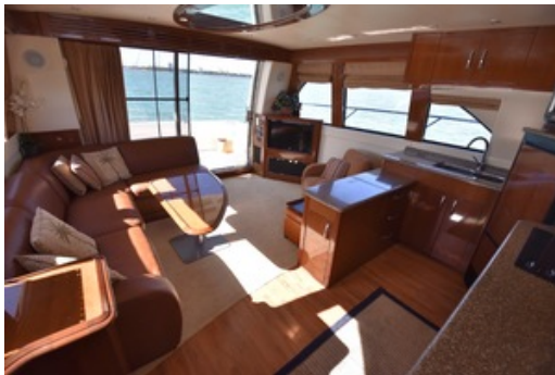
Carver 52 Voyager 2008 - Salon