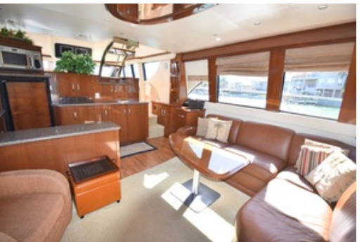
Carver 52 Voyager 2008 - Salon