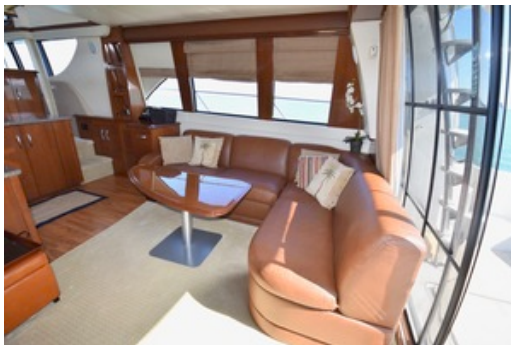
Carver 52 Voyager 2008 - Salon