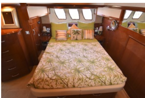
Carver 52 Voyager 2008 - Master Stateroom