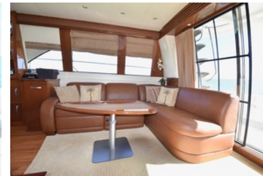
Carver 52 Voyager 2008 - Salon