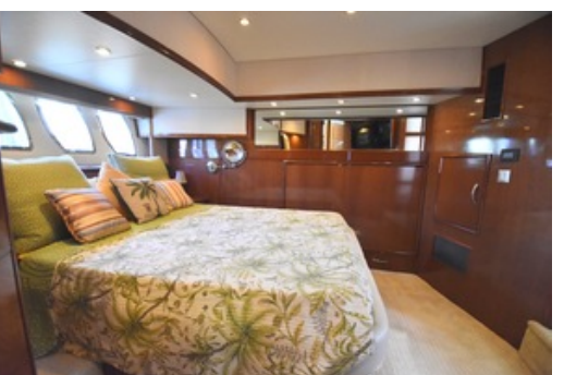
Carver 52 Voyager 2008 - Master Stateroom