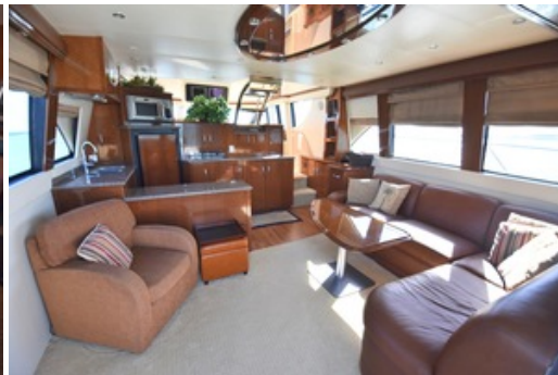
Carver 52 Voyager 2008 - Salon