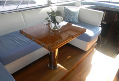
2014 Princess V48 - High Gloss Custom Table