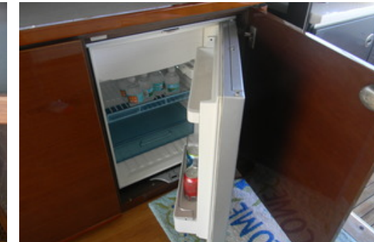
2014 Princess V48 - Upper Salon Refrigerator