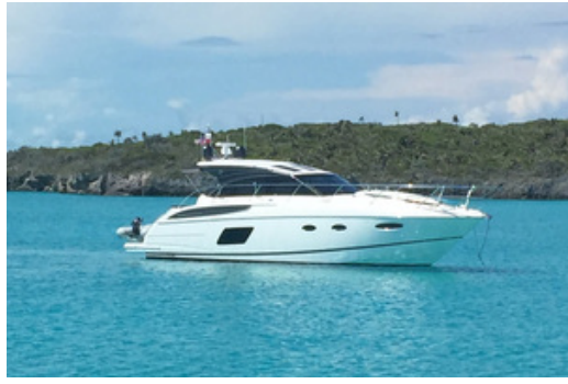
2014 Princess V48 - Profile