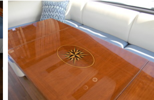
2014 Princess V48 - Custom Table with Inlay