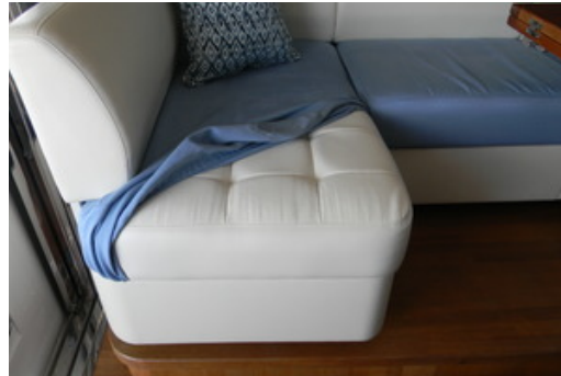
2014 Princess V48 - Upper Salon - Removable Covers