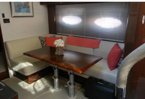
2014 Princess V48 - Lower Salon Dinette