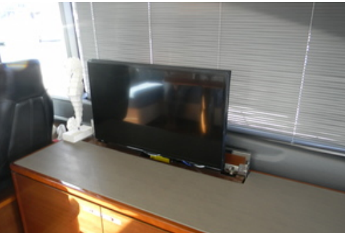
2014 Princess V48 - Upper Salon TV