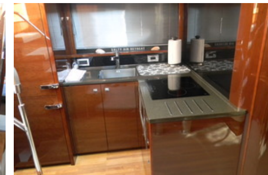
2014 Princess V48 - Galley