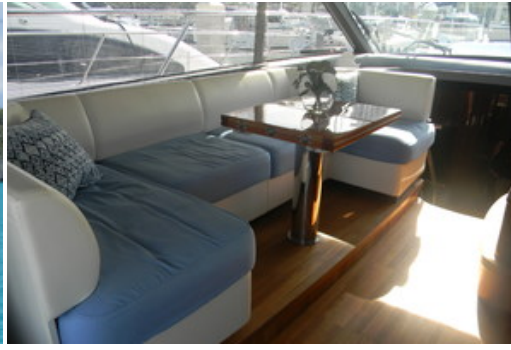
2014 Princess V48 - Upper Salon Dinette