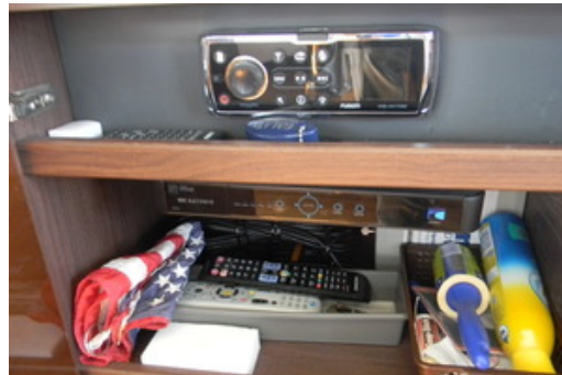
2014 Princess V48 - Audio System/SAT TV Receiver