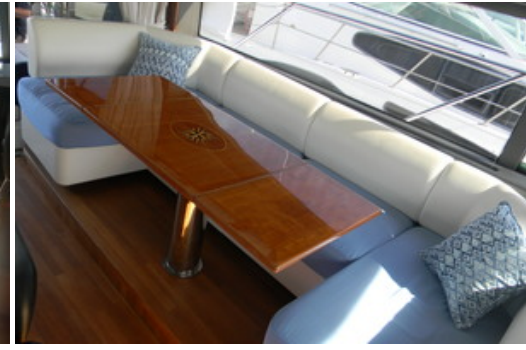
2014 Princess V48 - Upper Salon Dinette